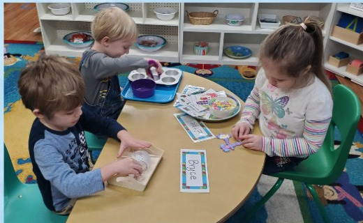
Three friends enjoying new April lessons.